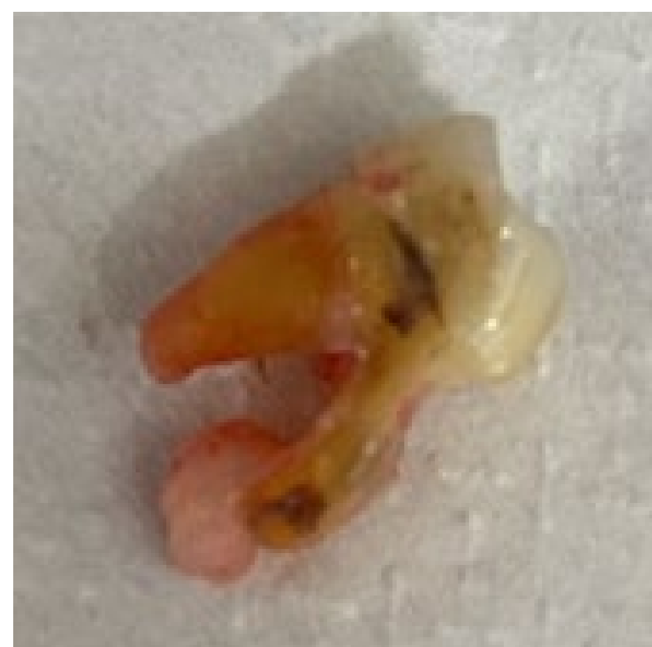
Figure 2: Extracted #14 and periapical tissues attached to the apex of palatal root