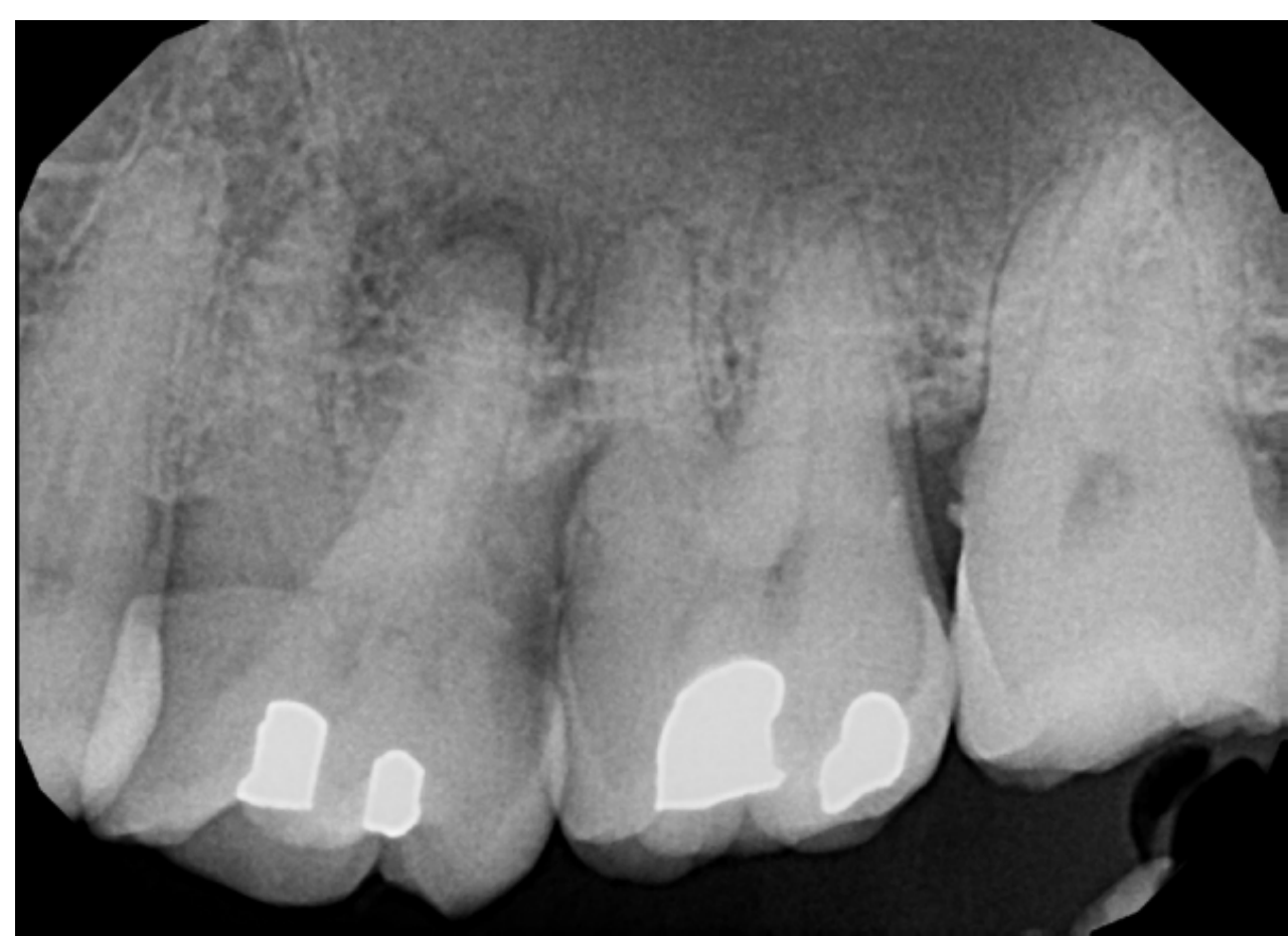
Figure 1: Periapical xray reveals loss of PDL at apex of palatal root of #14 and generalized moderate horizontal bone loss in the upper left quadrant.